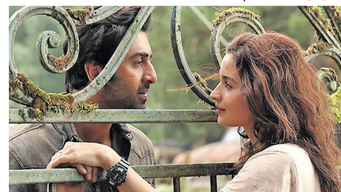
The two leads – Ranbir Kapoor and Alia Bhatt